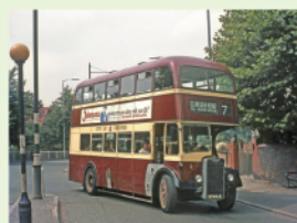
The Hough Green Local History Group

Hough Green has a long history as the main route from Chester to Wales and Ireland and as an area of industry.