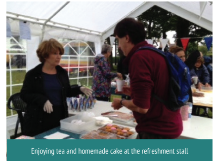
Enjoying tea and homemade cake at the refreshment stall