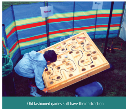
Old fashioned games still have their attraction