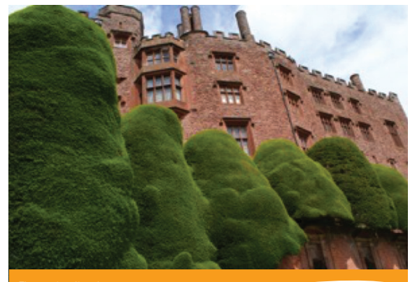
The amazing clipped yew trees