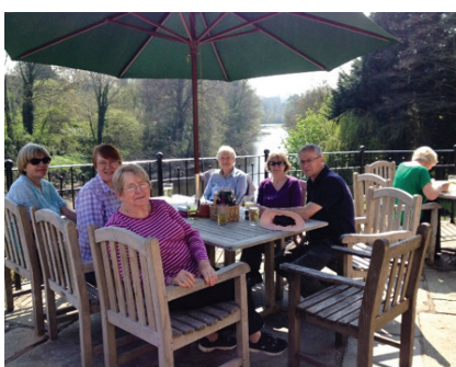
Residents enjoying some of our recent walks over the summer