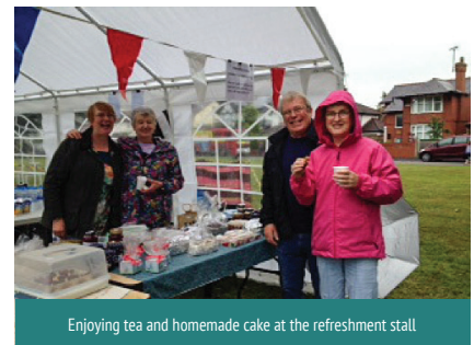
Enjoying tea and homemade cake at the refreshment stall