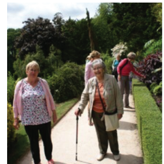
Promenading on the terrace