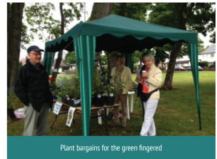
Plant bargains for the green fingered