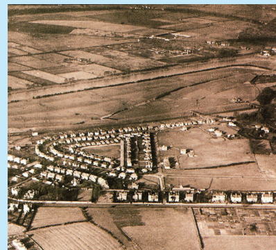
Pictured above: Curzon Park from the South circa 1930