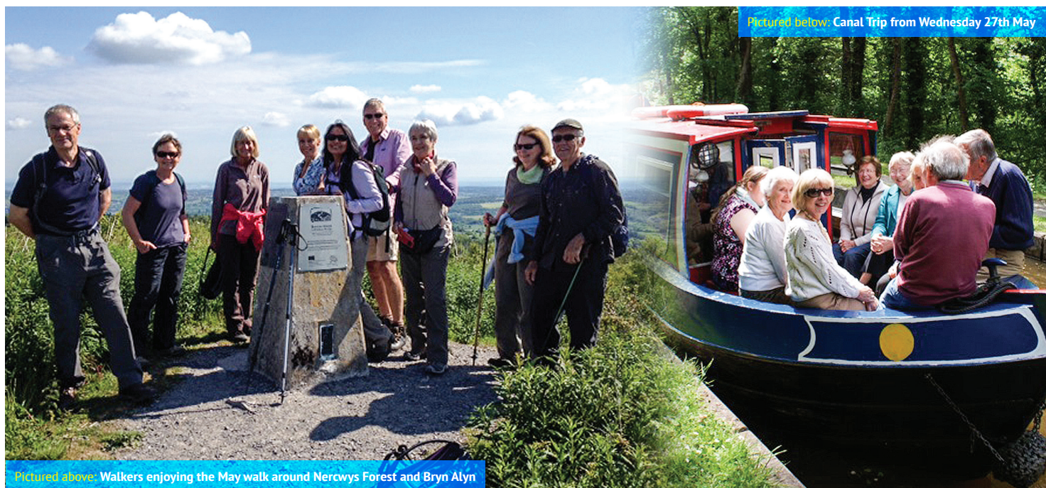
Pictured below: Canal Trip from Wednesday 27th May